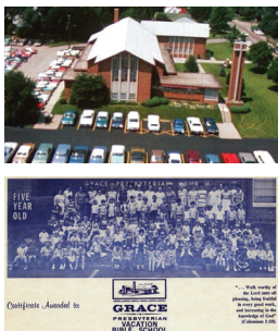
Forrest Hill and Knoxville 1957-1973