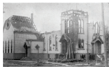
Fire destroyed the church at Wayne and Madison

By the early 1930s, church attendance and finances had fallen very low, and the future of the church was in doubt. There were talks of merging with another church or possibly dissolving the church completely. By a slim margin, the congregation decided to try calling one more pastor who might help the church grow.