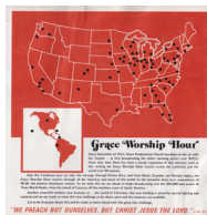
Grace Worship Hour Reach in 1973