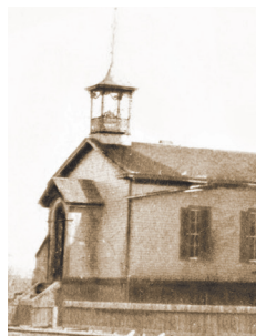
First building at Clay and Green Streets (1862)